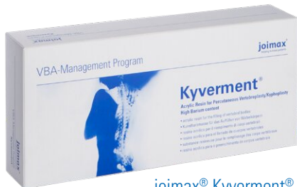
joimax® Kyverment® Set

Stabilization of vertebral compression fracture through kyphoplasty and bilateral cement injection.